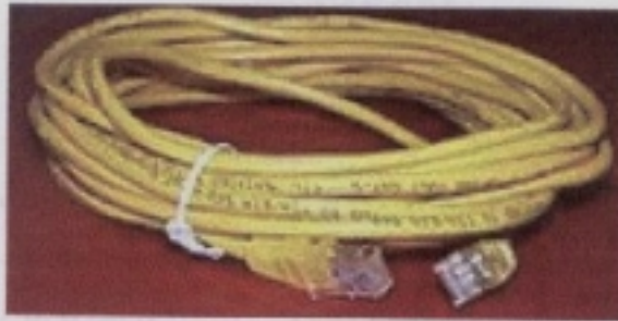
Figure 5: Cat 5 Twisted Pair Cables

Cables unlimited 1000Ft Cat 5 Twisted Pair are used as physical links between routers, switches, hubs, servers and workstations