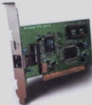
Figure 4: PCI 10/100 Ethernet Network Adapter

Also, we need 10/100 Fast Ethernet NIC (Network Adapters) in order to connect each workstation and servers to the Ethernet network.