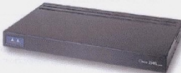
Figure 2: Cisco 2620 Router

Since each router has only 1 or 2 internal CSU/DSU, we will need external ones to connect the router to either other router using T1 lines.