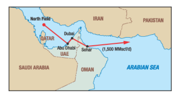
Figure 2: Qatari Gas transportation to UAE, Omani and Pakistan Market