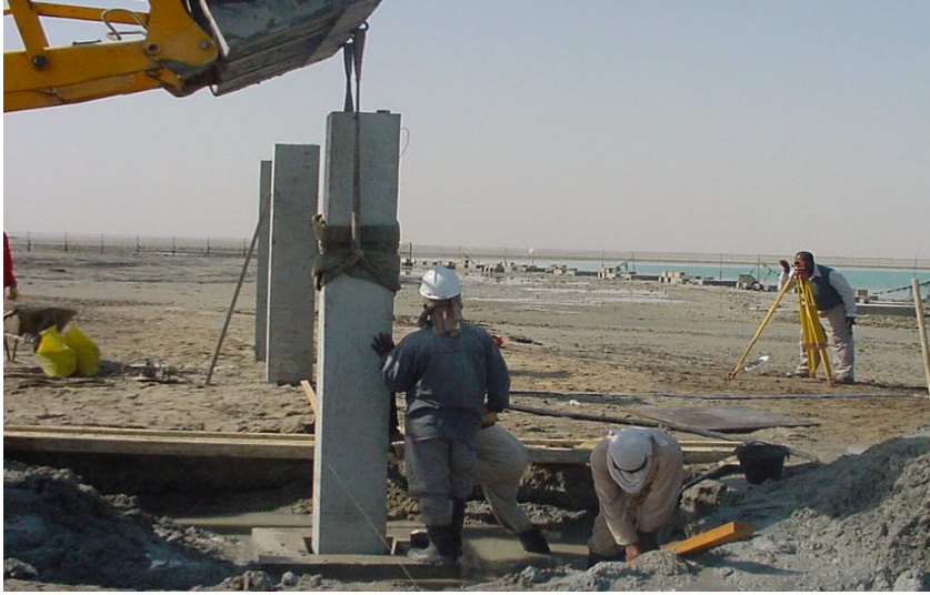
Figure 2. Erection of a reinforced concrete column in zone 2.