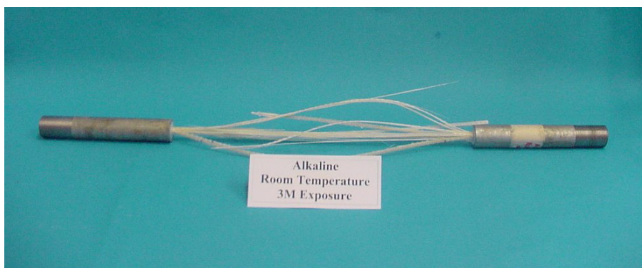
Figure 2. Typical failure mode of GFRP bar in tension.

With regard to the modulus of elasticity, alkaline and alkaline+chloride solutions showed more effect on the modulus of elasticity than the acid solution at both 22 and 60 °C. After six months of continuous immersion in alkaline+chloride solution at a temperature of 60 °C, the GFRP bars experienced a reduction of 25.2 % compared to 22.3 % in alkaline solution. While the GFRP bars in acid solution showed 12.9 % reduction after 6 months of continuous immersion.